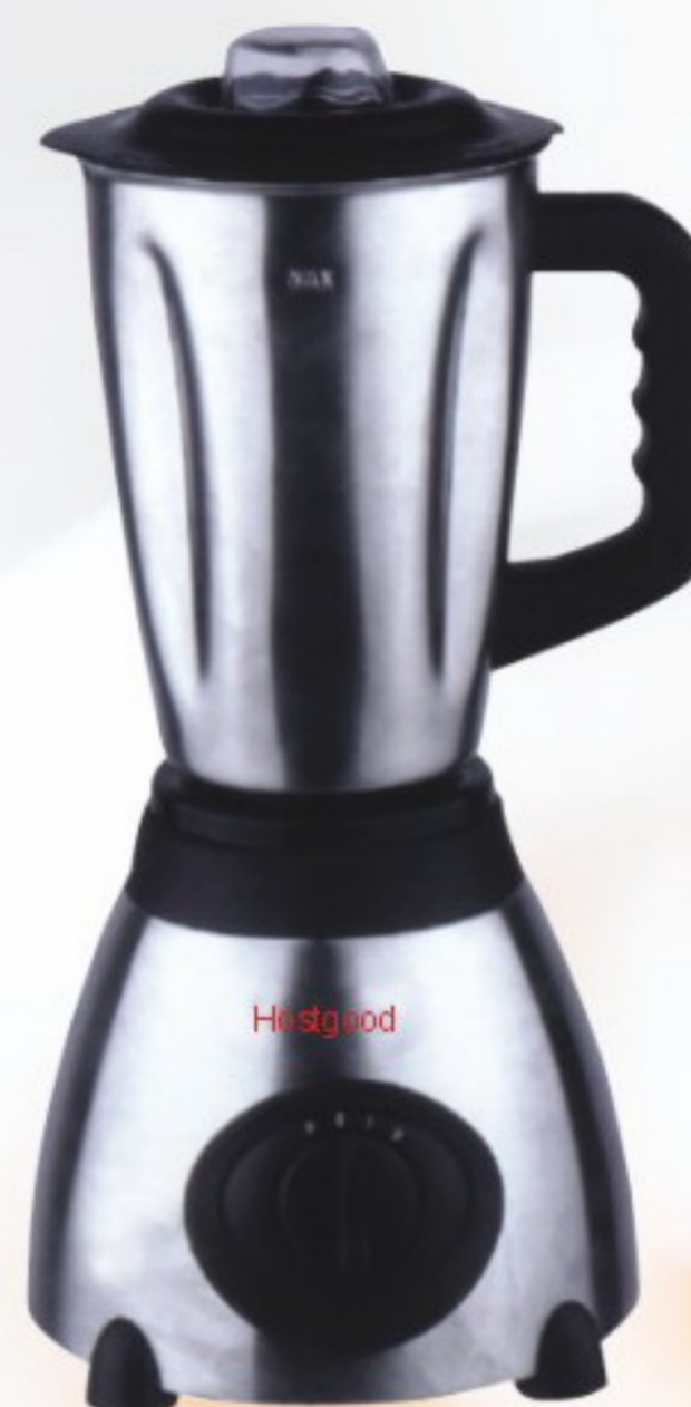
MODEL No: HL-2080B