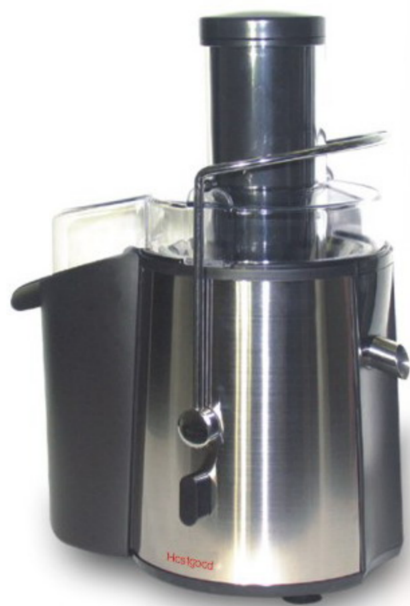
MODEL No: SL380J