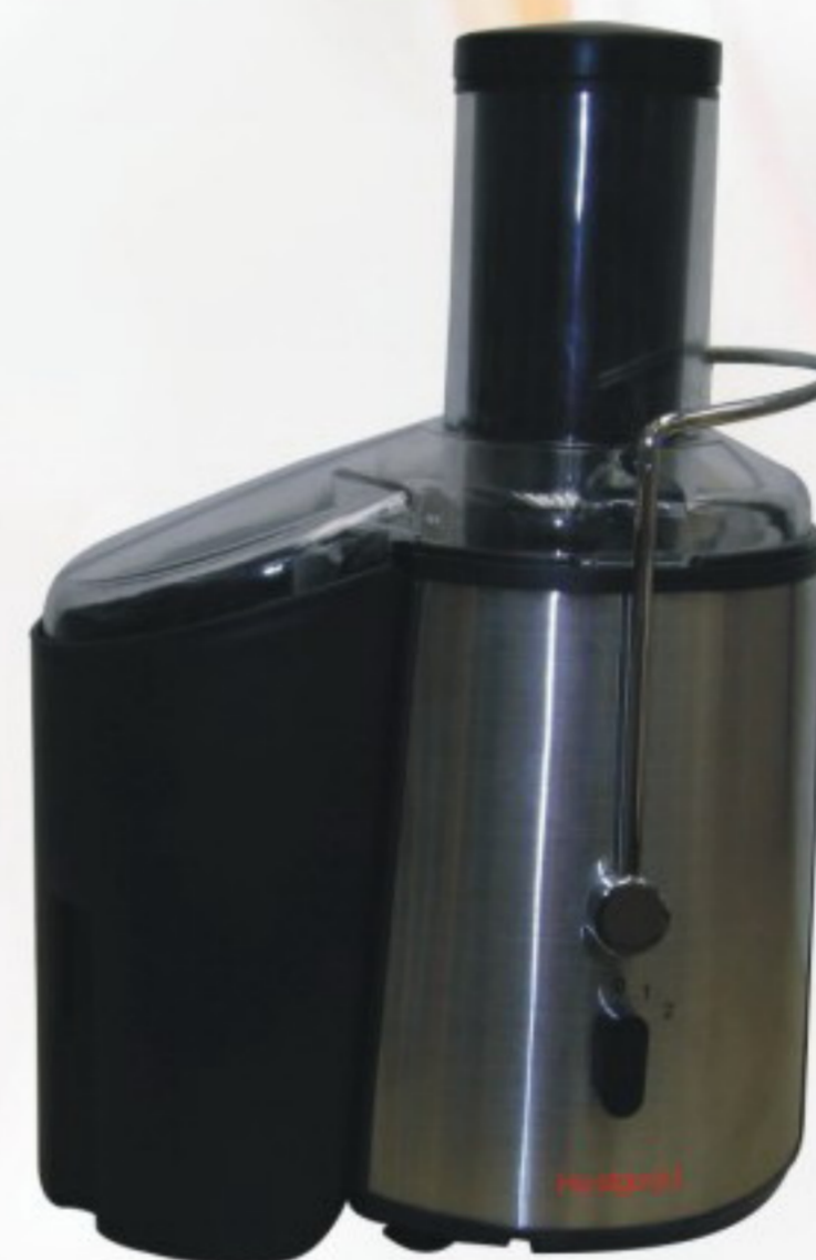
MODEL No: SL380J